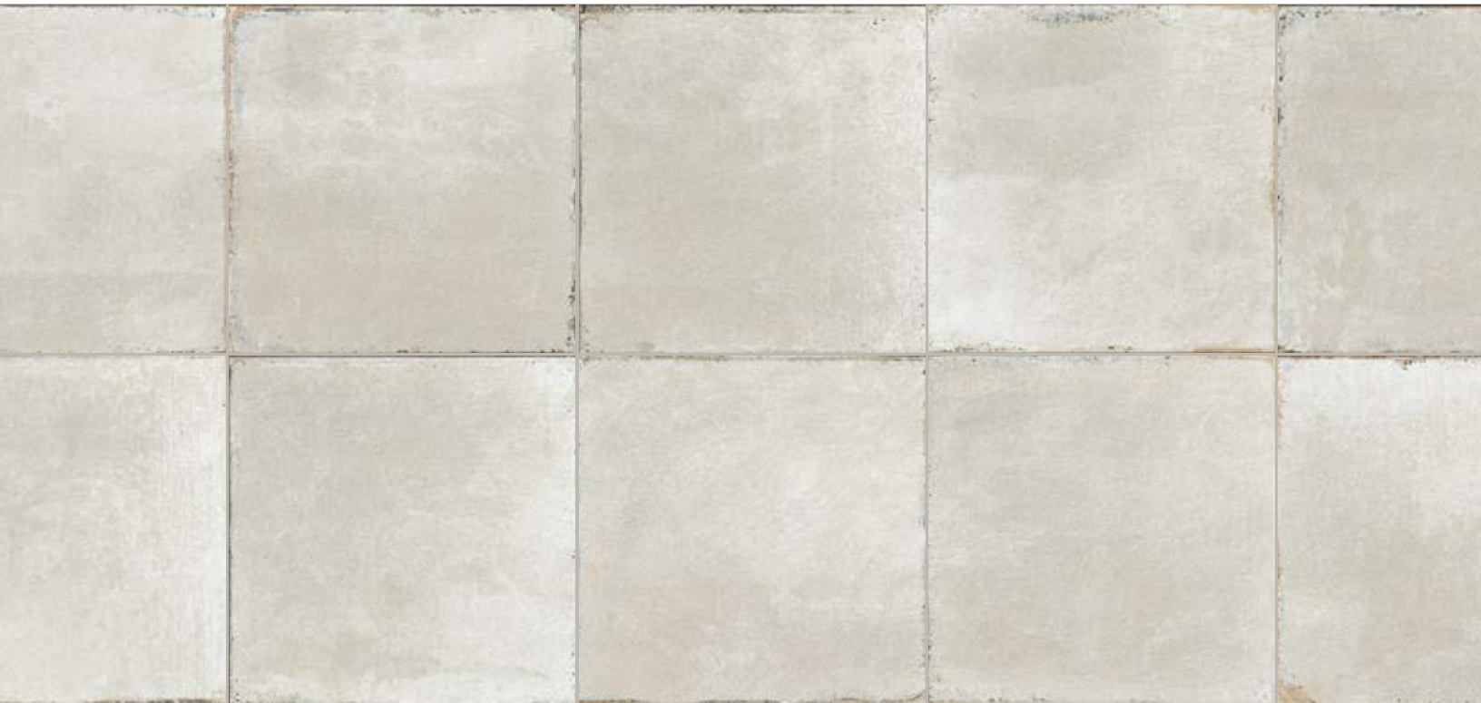
66BARSTO Barcelona 6"x 6" Stone 81