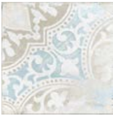
6" x 6"