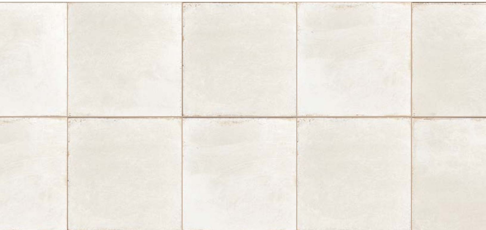
66BARPOR Barcelona 6" X 6" Porcelain 81