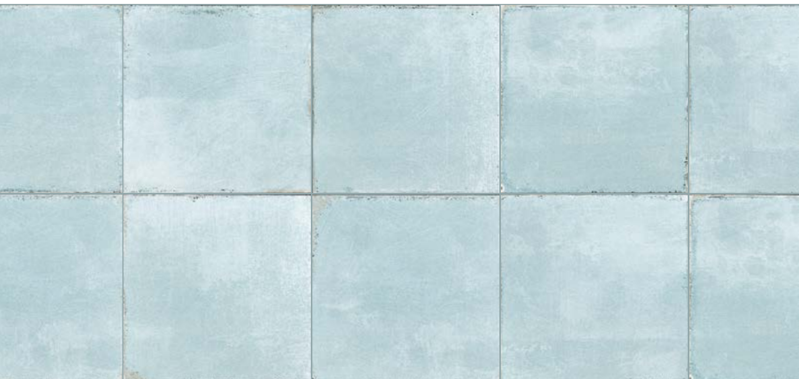
66BAROCN Barcelona 6"x 6" Ocean 81