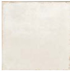
6" x 6"