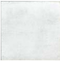
6" x 6"