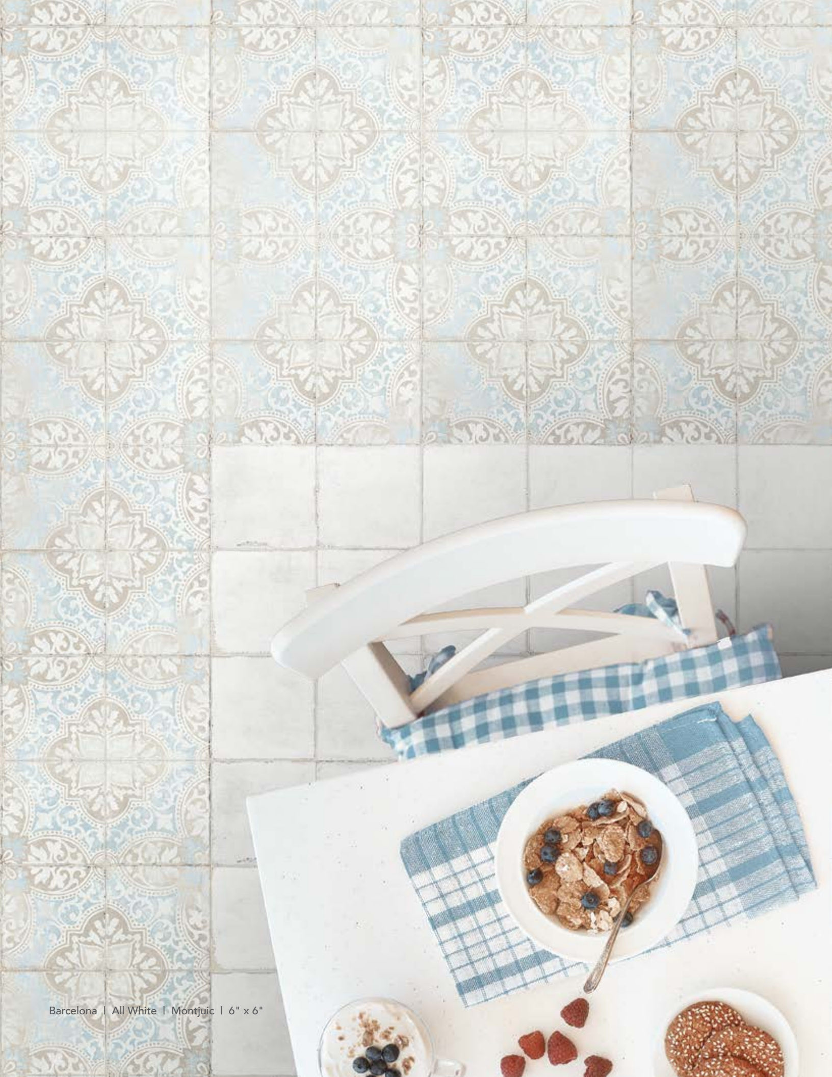
Barcelona | All White | Montjuic | 6" x 6"