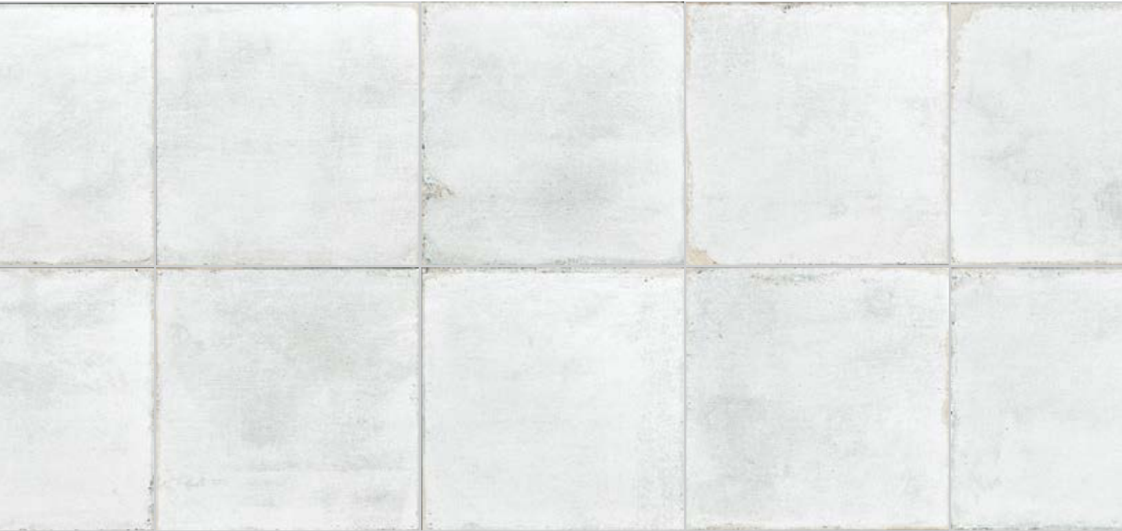
66BARAWT Barcelona 6" x 6" All White 81