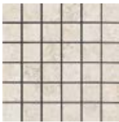
TERM8672 2" x 2" Brook Beige Mosaic 11.75" x 11.75" Mesh - 0.959 Sqft/Sheet 187