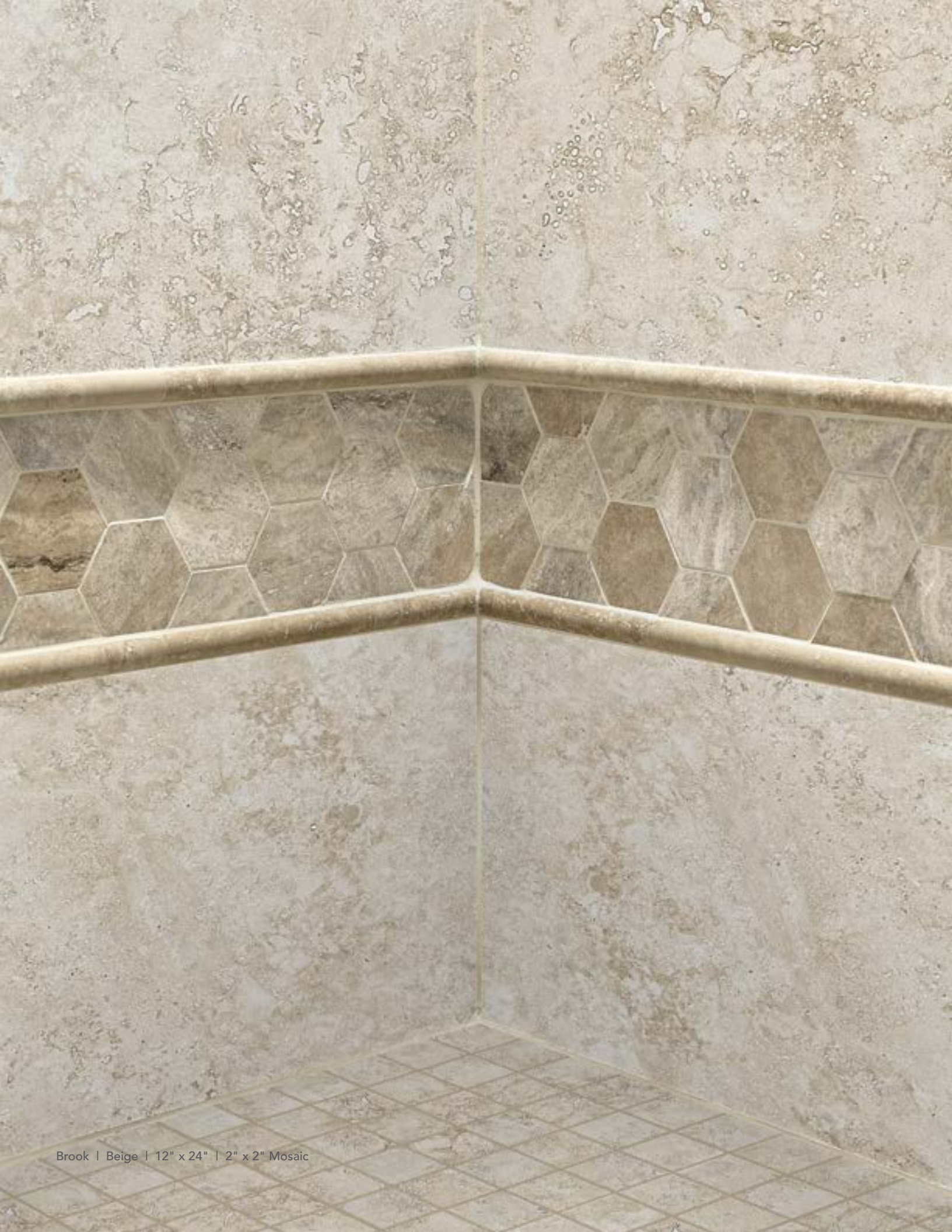
Brook | Beige | 12" x 24" | 2" x 2" Mosaic