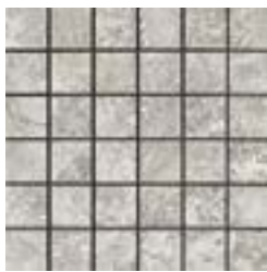
TERM8563 2" x 2" Brook Grey Mosaic 11.75" x 11.75" Mesh - 0.959 Sqft/Sheet 187