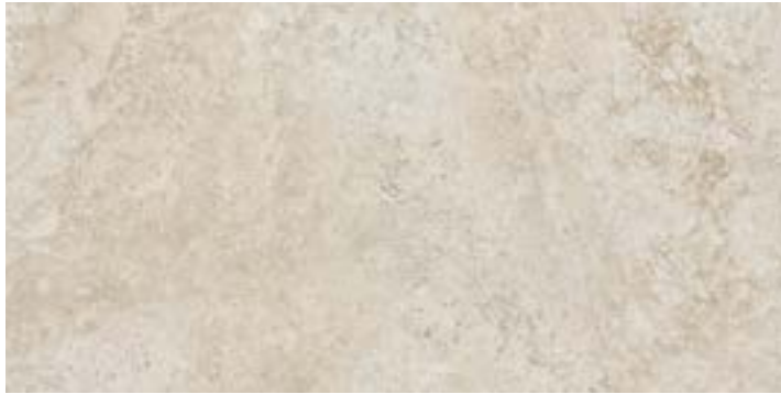
TERP9342 12" x 24" Brook Beige 25