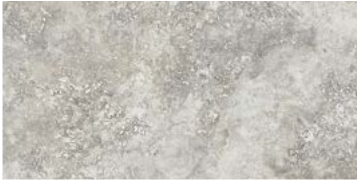
TERP9359 12" x 24" Brook Grey 25