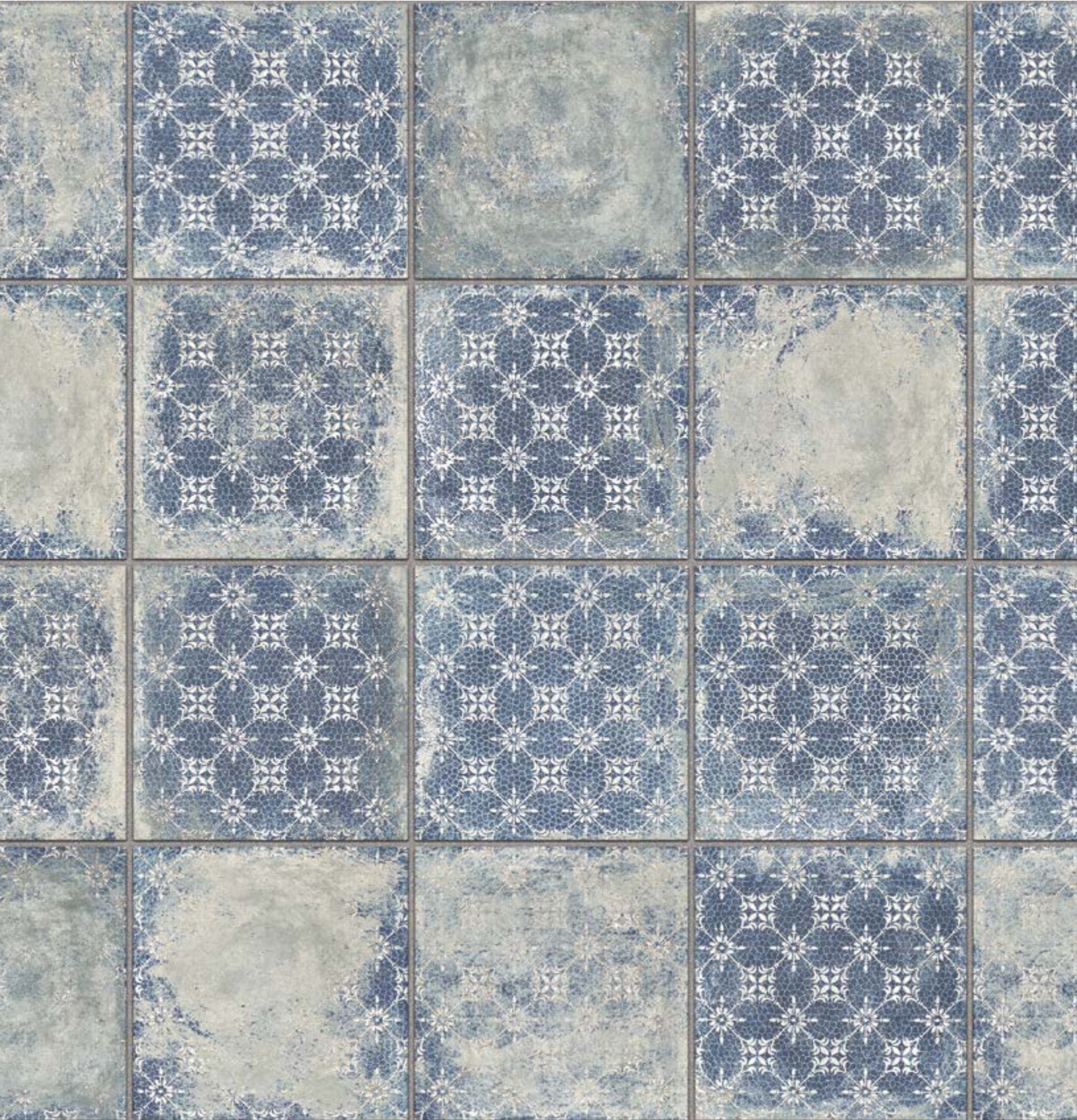
CLYFOEVE 8" x 8" Clay Fossil Eve