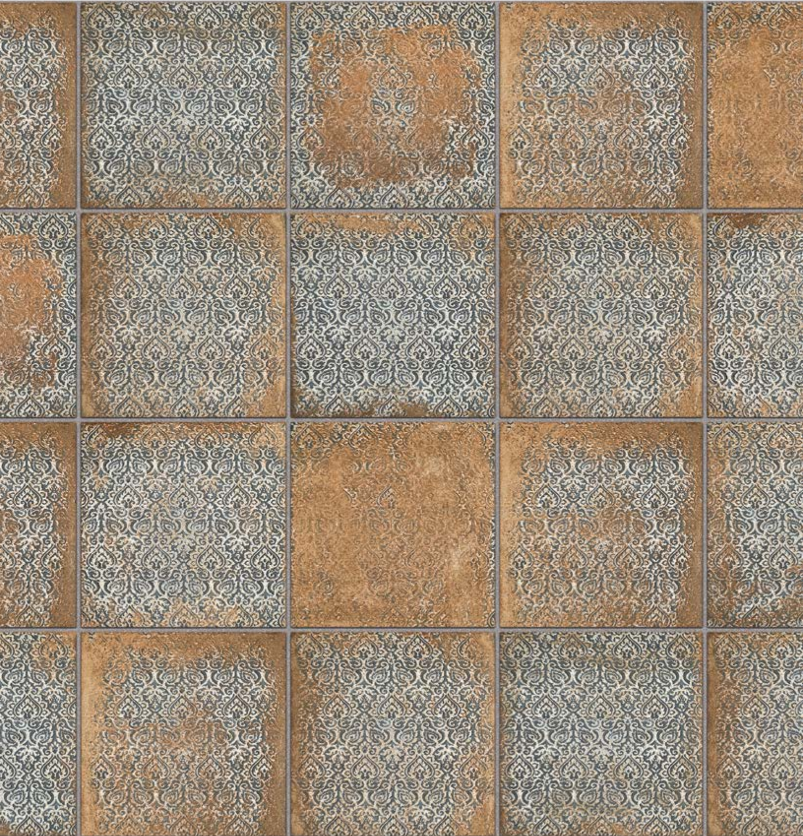
CLYSNELV 8" x 8" Clay Sienna Elvia