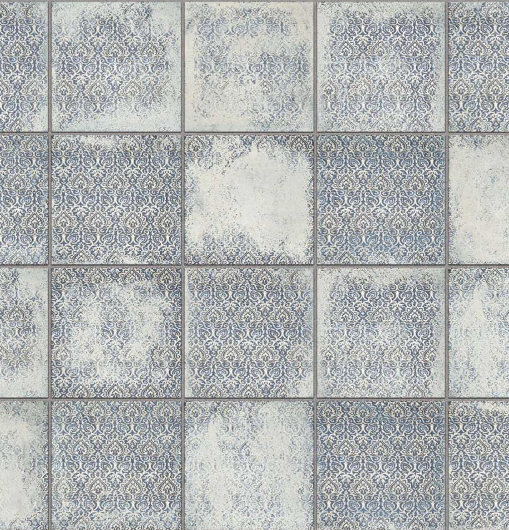
CLYGRELV 8" x 8" Clay Glacier Elvia