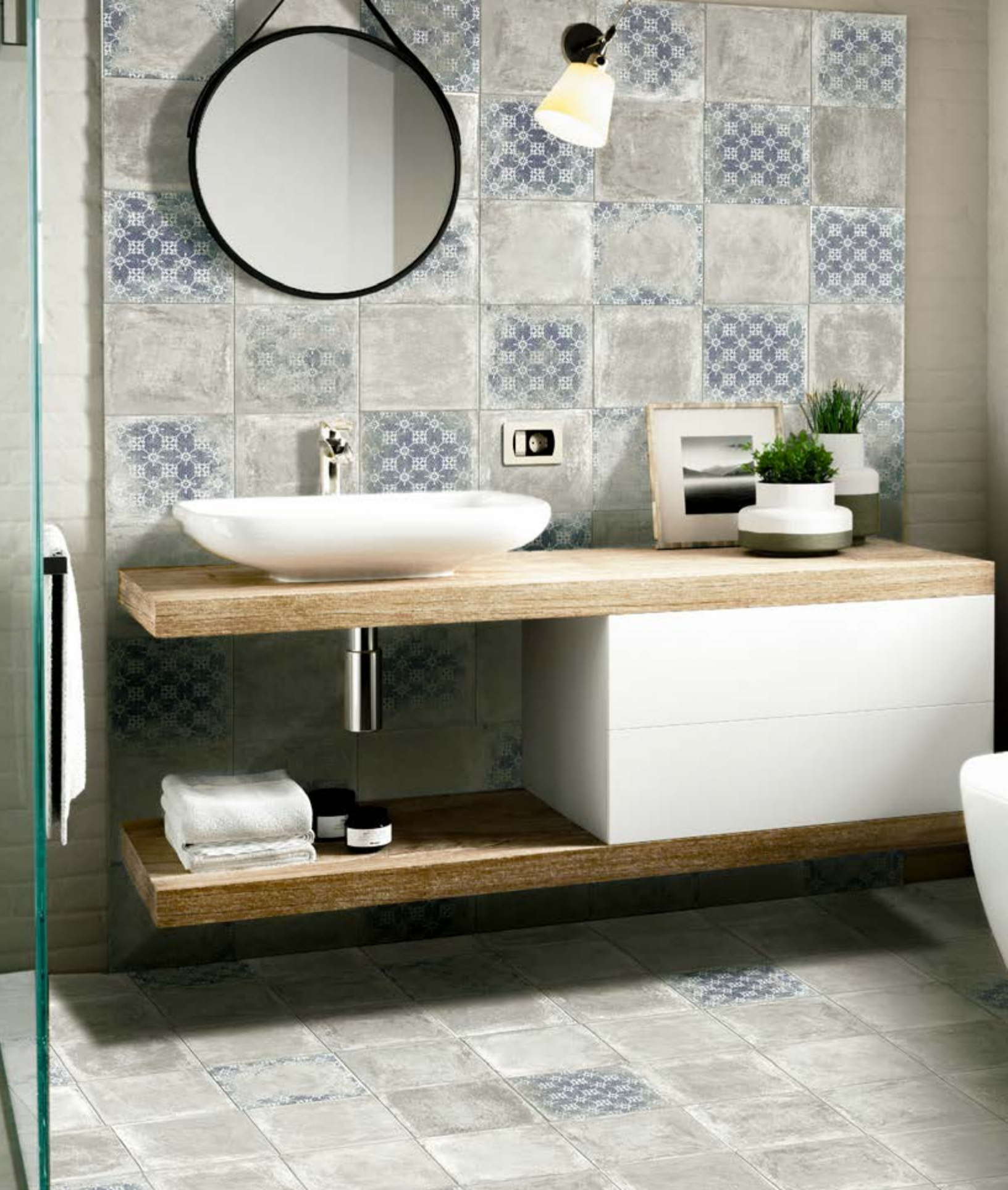
Clay | Fossil | Fossil Eve | 8" x 8"