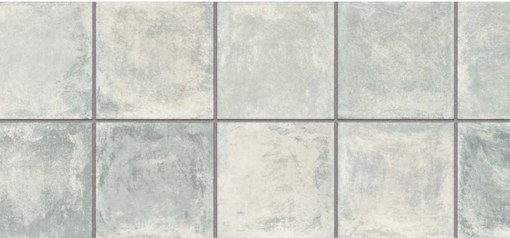
CLYFOSSL 8" x 8" Clay Fossil