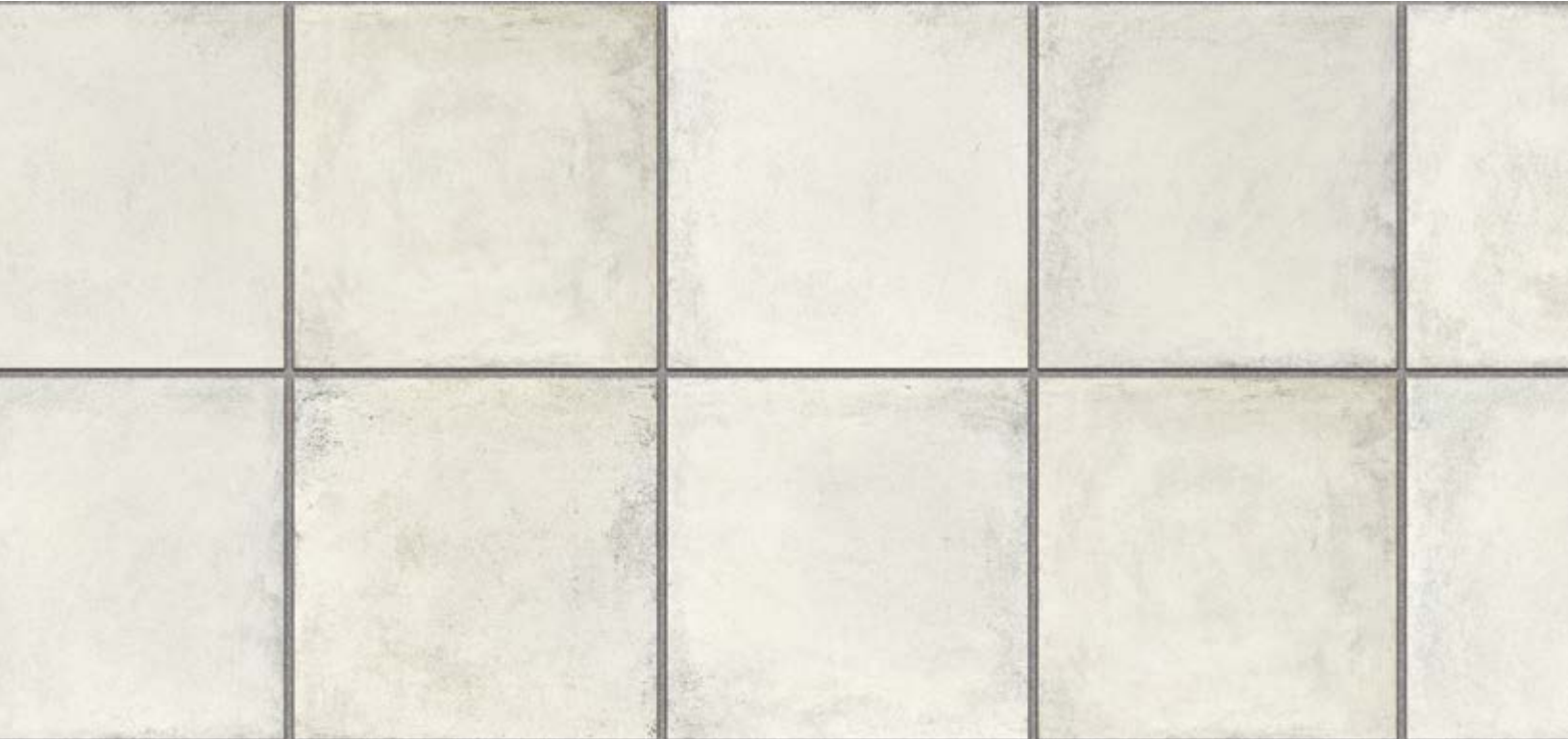
CLYGLACI 8" x 8" Clay Glacier