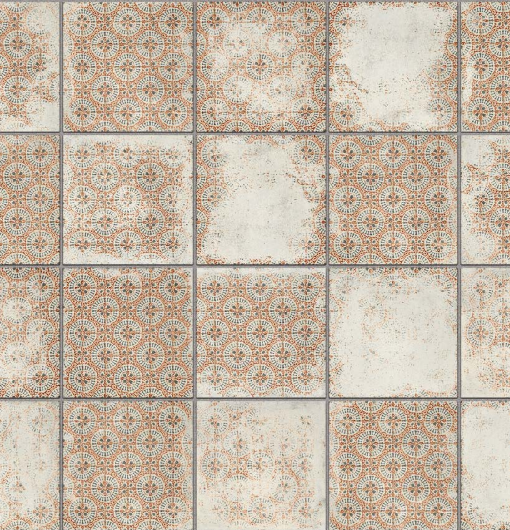
CLYGRALA 8" x 8" Clay Glacier Alanis