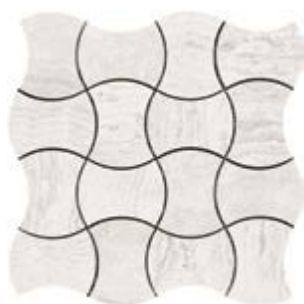
CR4555 Domus Bianco Trama Matt 12" x 12" Mesh - 1 Sqft/Sheet 250