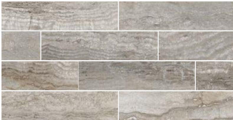
CP4577 4" x 16" Domus Piombo Rect Matt 157