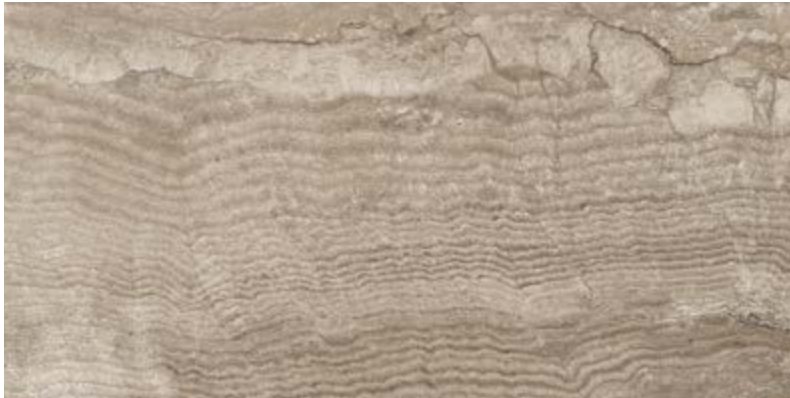
CT4364 16" x 32" Domus Visone Rect Matt 82