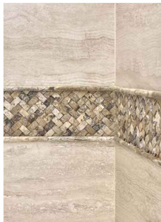
Products Shown 1x2 Antik Onyx Herringbone Honed / Cambered - O392970 Antik Onyx Bullnose-1- P395812 16" x 32" Domus Beige Rect Matt - CT4296