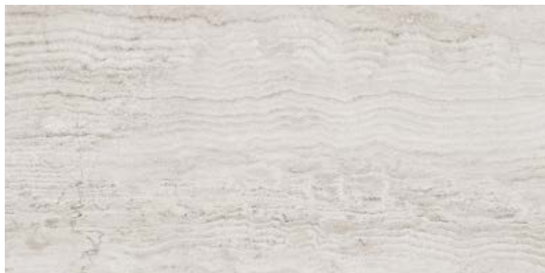
CT4406 16" x 32" Domus Bianco Rect Matt 82