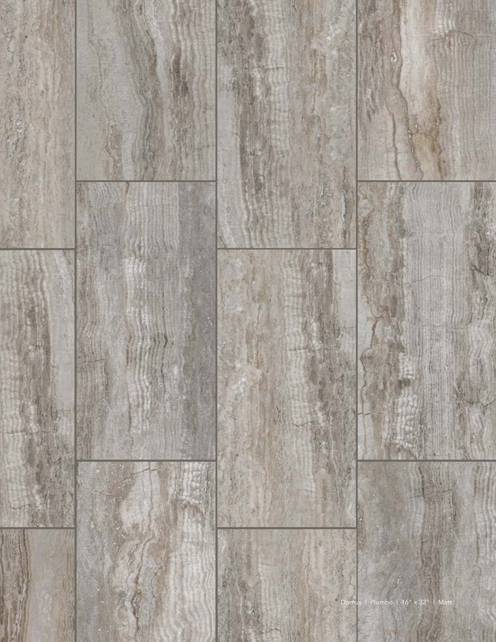
Domus | Piombo | 16" x 32" | Matt