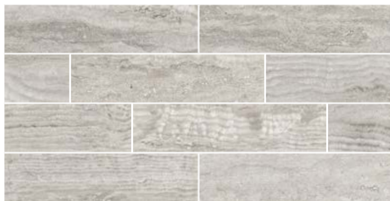
CP4584 4" x 16" Domus Grigio Rect Matt 157