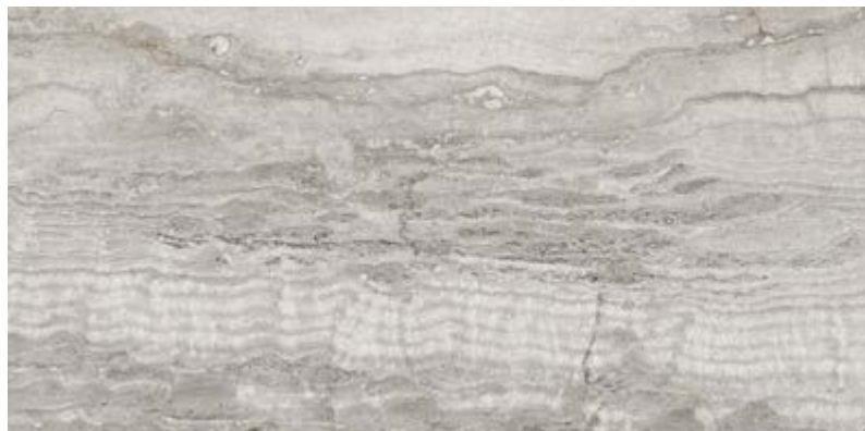
CT4392 16" x 32" Domus Grigio Rect Matt 82