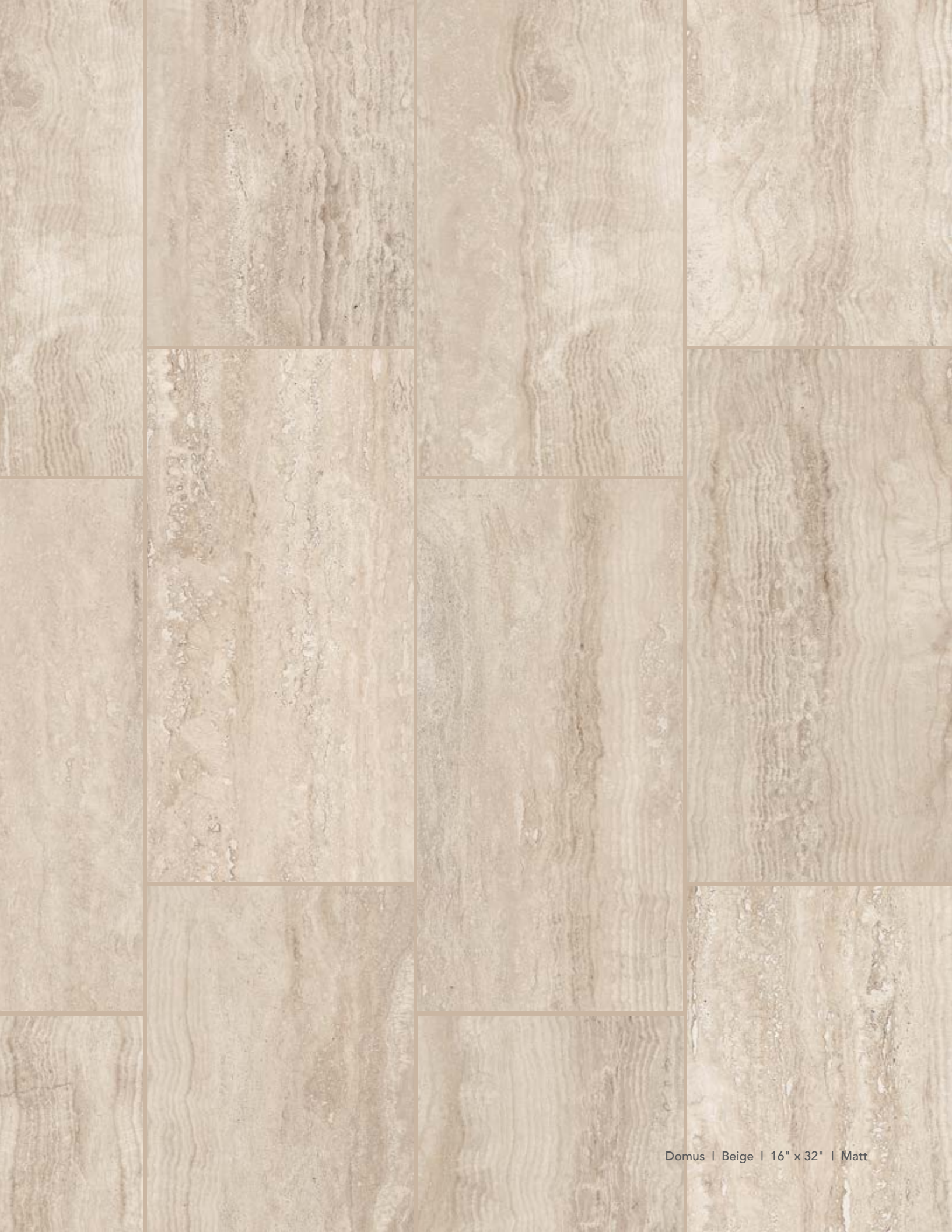
Domus | Beige | 16" x 32" | Matt