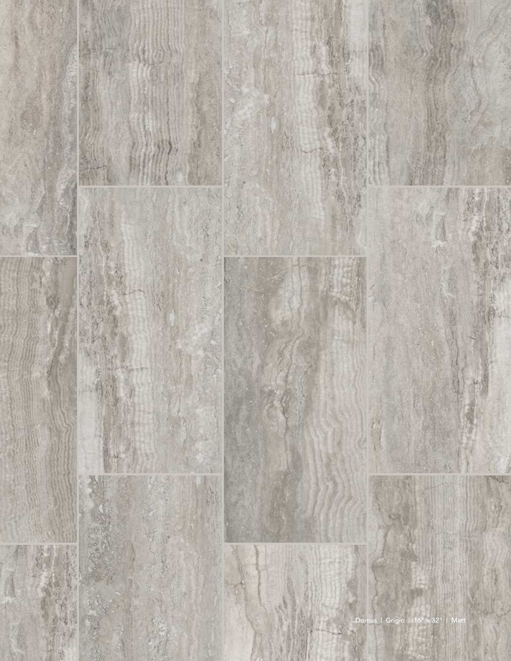
Domus | Grigio | 16" x 32" | Matt