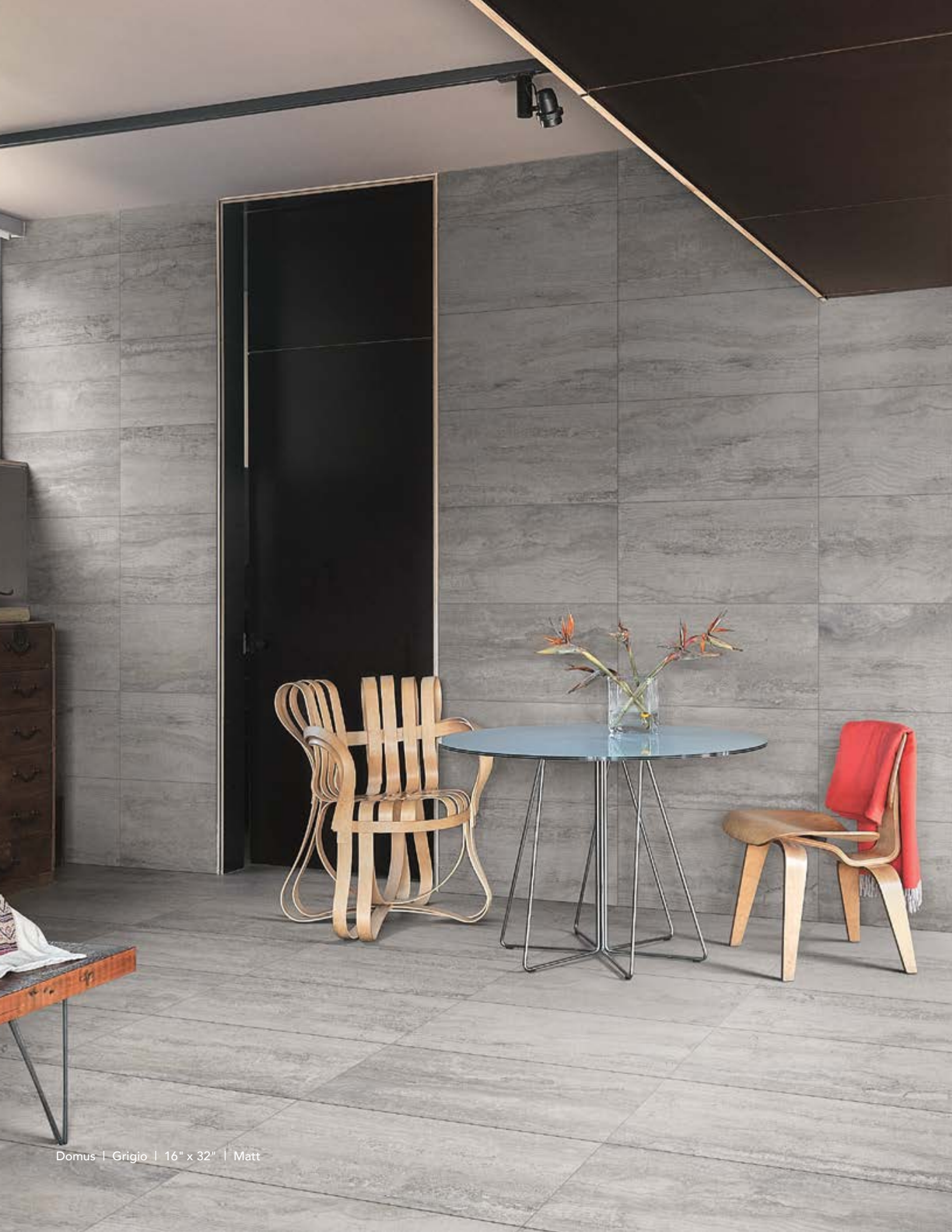
Domus | Grigio | 16" x 32" | Matt