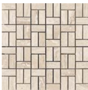
CM4561 Domus Beige 1" x 2" Brick Matt 12" x 12" Mesh - 1 Sqft/Sheet 222