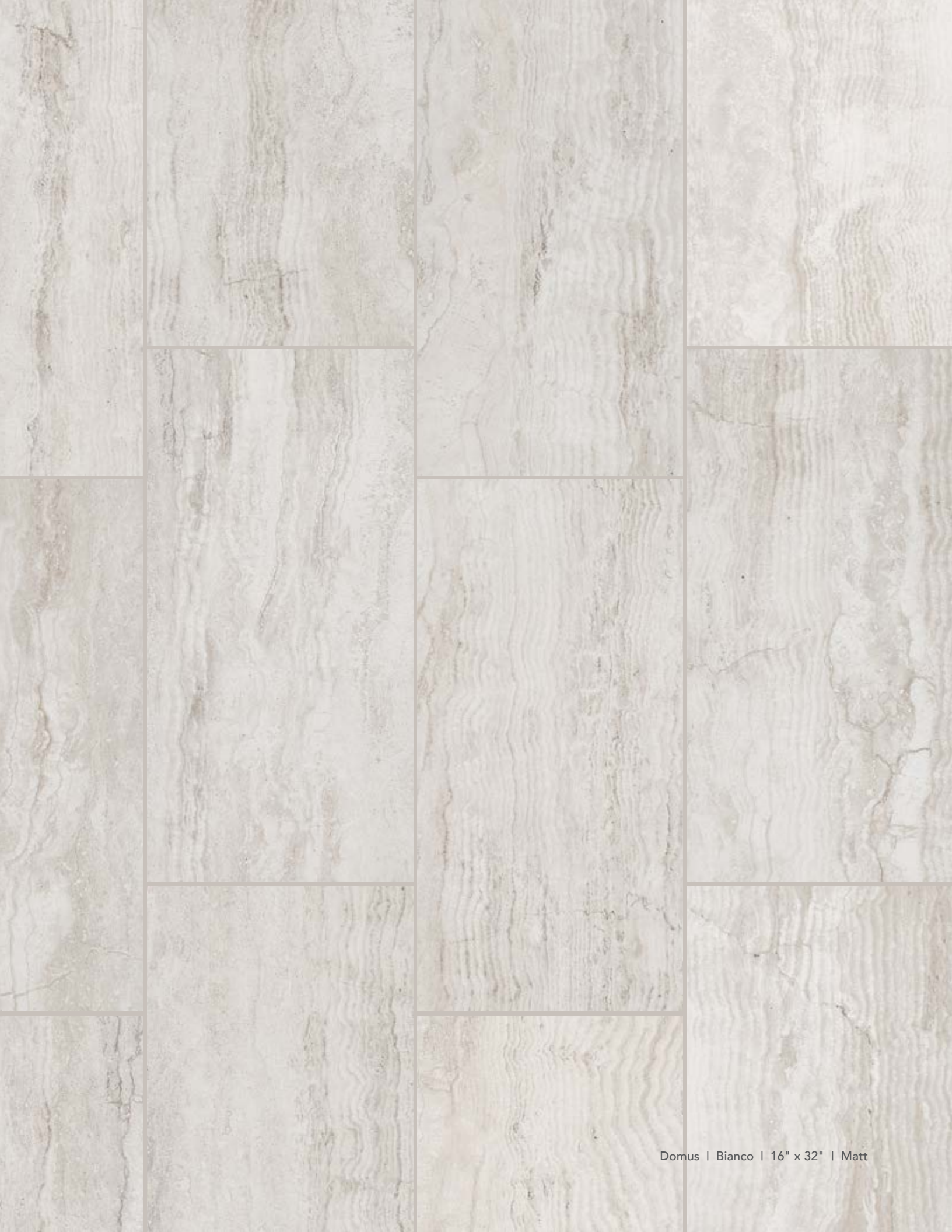
Domus | Bianco | 16" x 32" | Matt