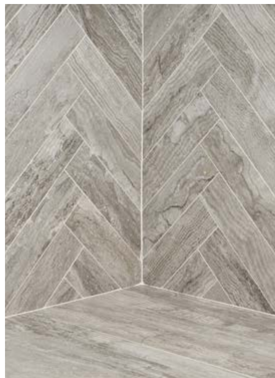
Products Shown 4" x 16" Domus Grigio Rect Matt - CP4584 16" x 32" Domus Grigio Rect Matt - CT4392