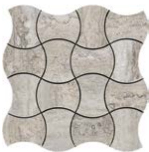
CR4576 Domus Piombo Trama Matt 12" x 12" Mesh - 1 Sqft/Sheet 250