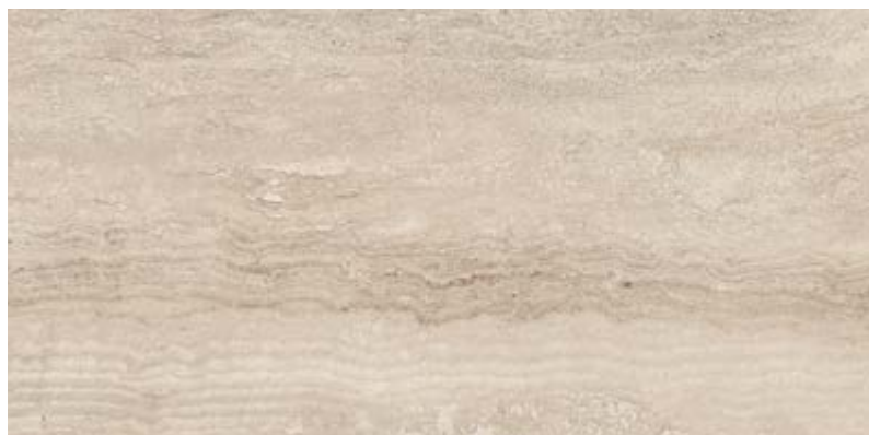
CT4296 16" x 32" Domus Beige Rect Matt 82