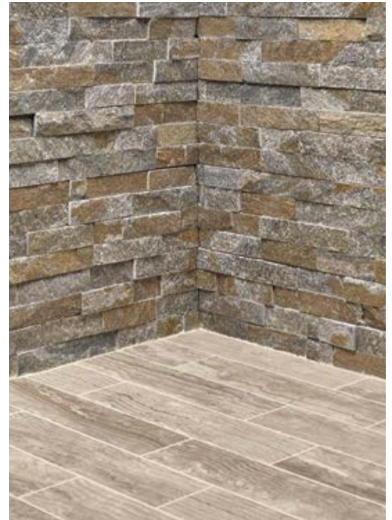
Products Shown Large Rusty Quartzite Ledger Stone - T522CZW04 4" x 16" Domus Visone Rect Matt - CP4570