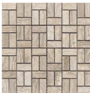
CM4568 Domus Visone 1" x 2" Brick Matt 12" x 12" Mesh - 1 Sqft/Sheet 222