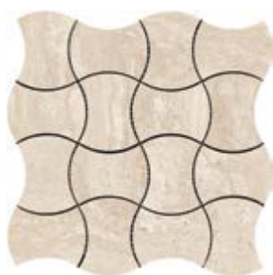
CR4562 Domus Beige Trama Matt 12" x 12" Mesh - 1 Sqft/Sheet 250