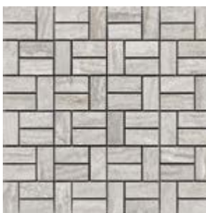
CM4582 Domus Grigio 1" x 2" Brick Matt 12" x 12" Mesh - 1 Sqft/Sheet 222