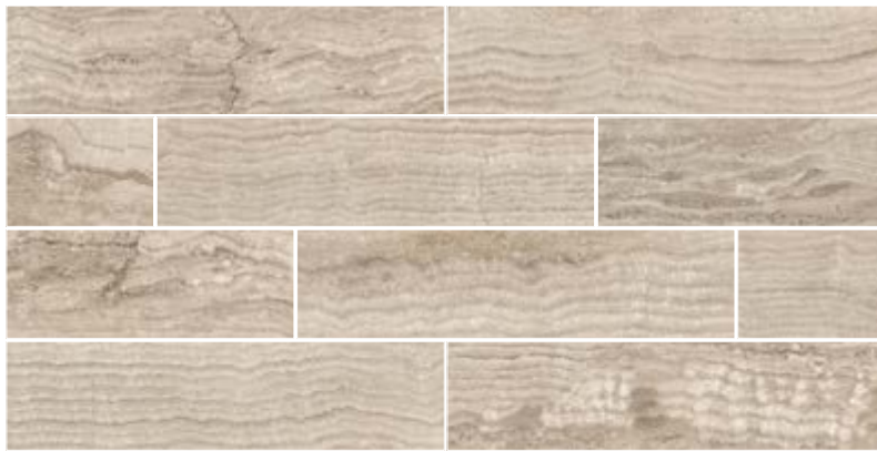
CP4570 4" x 16" Domus Visone Rect Matt 157