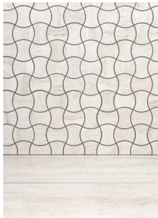
Products Shown Domus Bianco Trama Matt - CR4555 16" x 32" Domus Bianco Rect Matt - CT4406