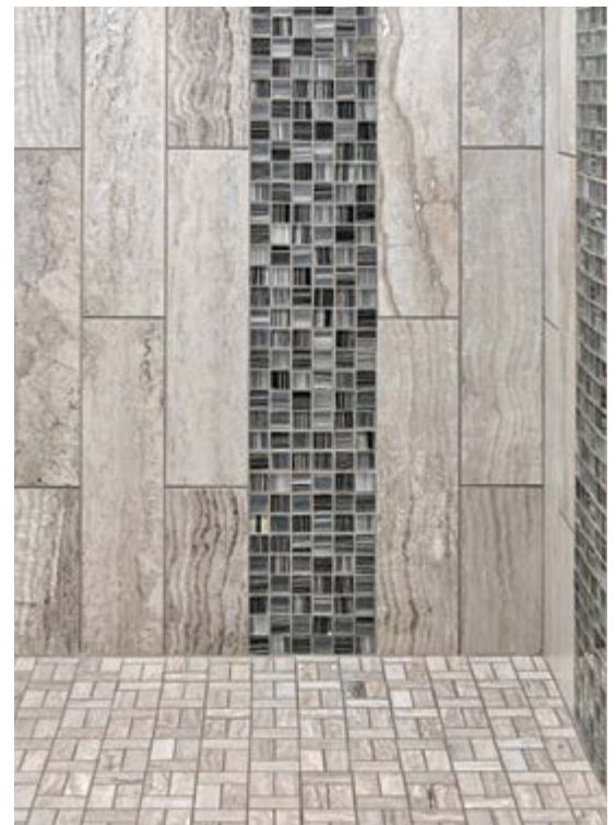
Products Shown 1x1 Bamboo Smoke Glass Mosaic - SH-232 4" x 16" Domus Piombo Rect Matt - CP4577 Domus Piombo 1" x 2" Brick Matt - CM4578