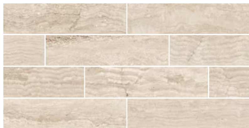
CP4563 4" x 16" Domus Beige Rect Matt 157