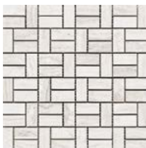
CM4554 Domus Bianco 1" x 2" Brick Matt 12" x 12" Mesh - 1 Sqft/Sheet 222