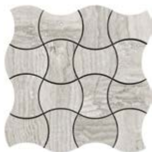
CR4583 Domus Grigio Trama Matt 12" x 12" Mesh - 1 Sqft/Sheet 250