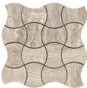
CR4569 Domus Visone Trama Matt 12" x 12" Mesh - 1 Sqft/Sheet 250