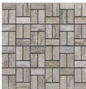
CM4578 Domus Piombo 1" x 2" Brick Matt 12" x 12" Mesh - 1 Sqft/Sheet 222