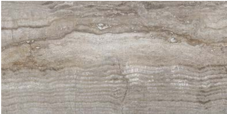
CT4378 16" x 32" Domus Piombo Rect Matt 82