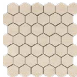
ENBOHX2 2" Endless Bone Honeycomb 11.875" x 11.875" - 0.979276 sqft/sheet