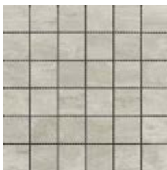
ENSI2X2 2" x 2" Endless Silver 11.75" x 11.75" Mesh - 0.959 Sqft/Sheet