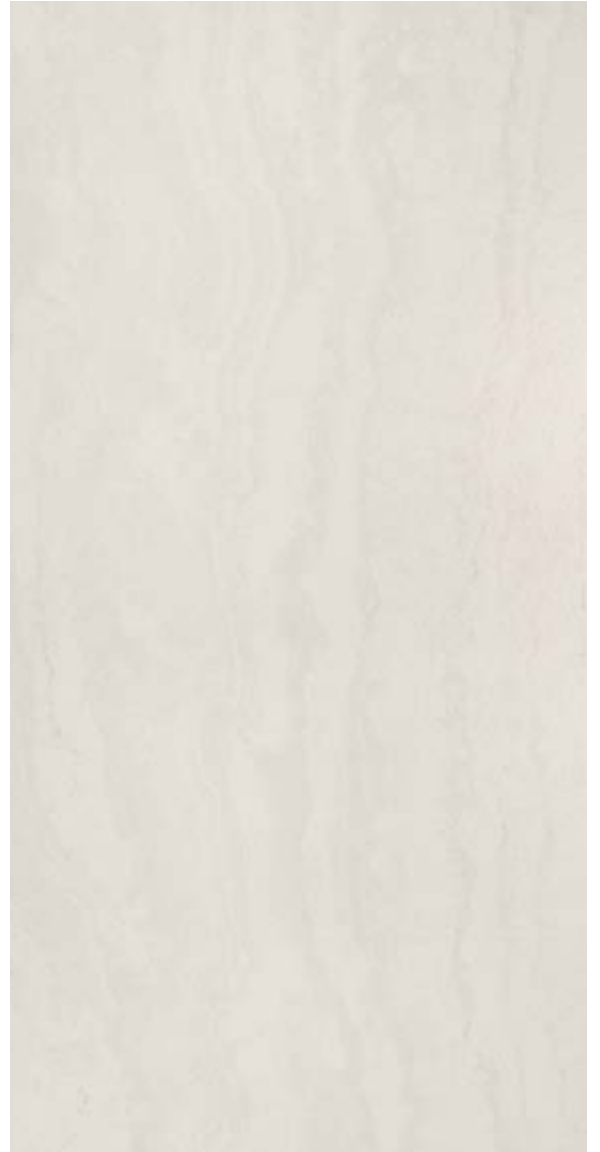
ENWH2448 24" x 48" Endless White