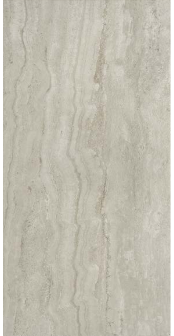
ENSI2448 24" x 48" Endless Silver