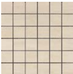
ENBO2X2 2" x 2" Endless Bone 11.75" x 11.75" Mesh - 0.959 Sqft/Sheet