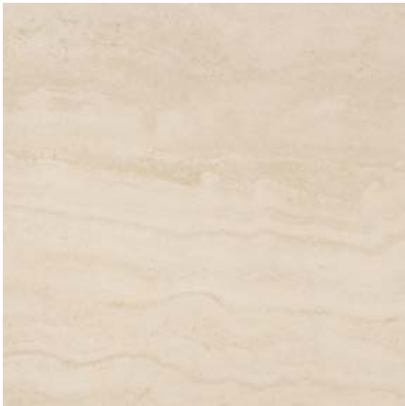
ENBO2424 24" x 24" Endless Bone