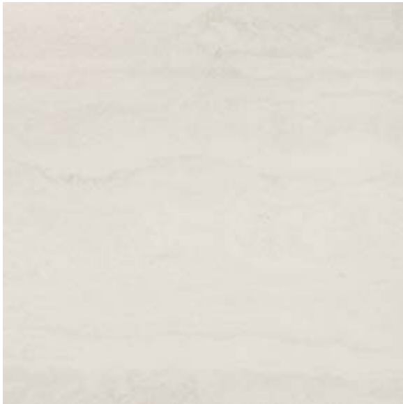
ENWH2424 24" x 24" Endless White