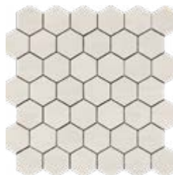
ENWHHX2 2" Endless White Honeycomb 11.875" x 11.875" - 0.979276 sqft/sheet