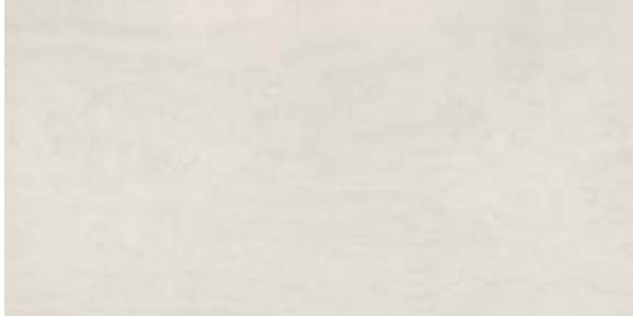
ENWH1224 12" x 24" Endless White