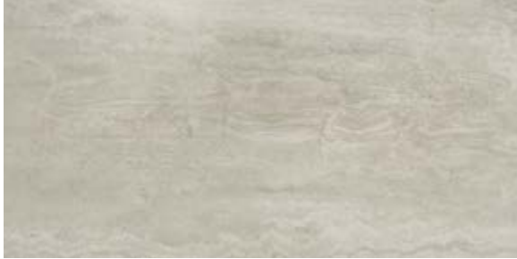
ENSI1224 12" x 24" Endless Silver