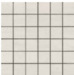
ENWH2X2 2" x 2" Endless White 11.75" x 11.75" Mesh - 0.959 Sqft/Sheet