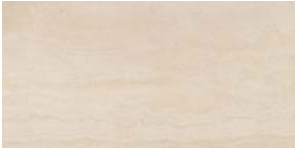
ENBO1224 12" x 24" Endless Bone