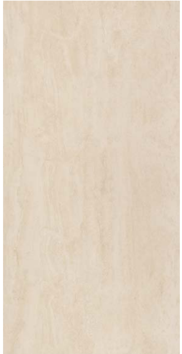
ENBO2448 24" x 48" Endless Bone