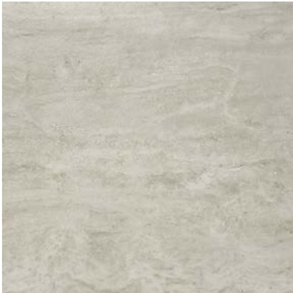
ENSI2424 24" x 24" Endless Silver