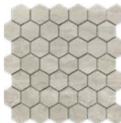
ENSIHX2 2" Endless Silver Honeycomb 11.875" x 11.875" - 0.979276 sqft/sheet