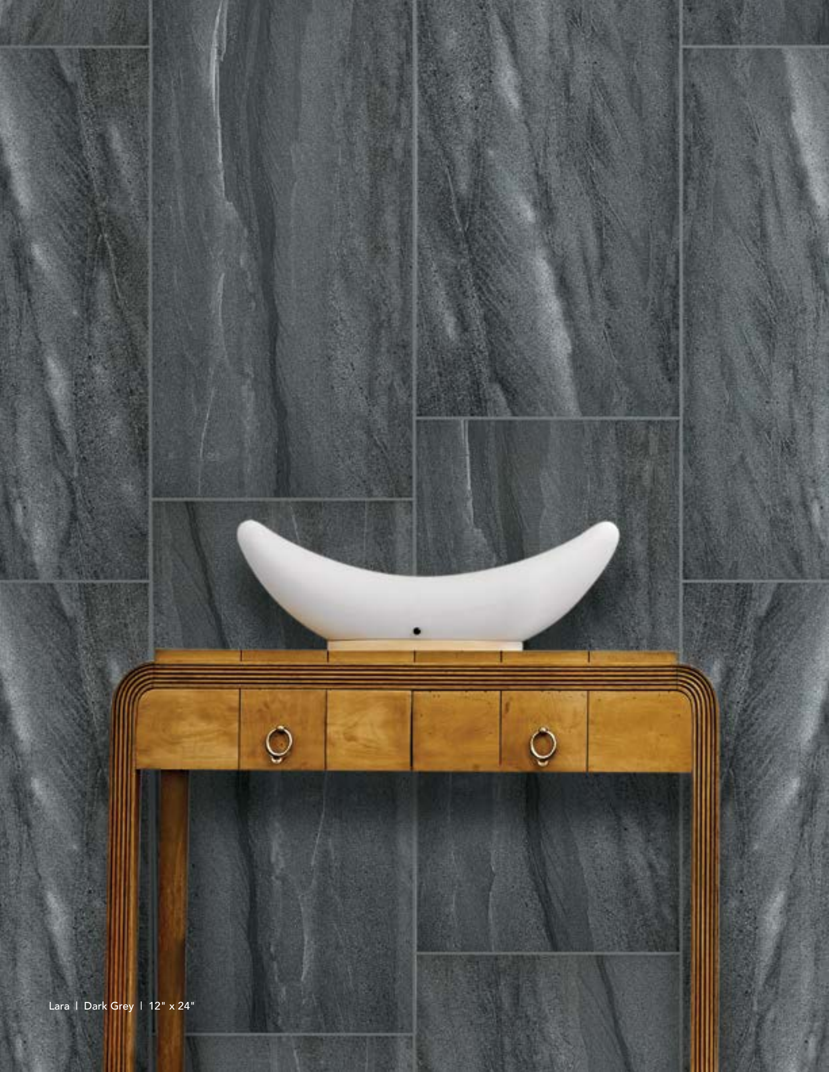
Lara | Dark Grey | 12" x 24"