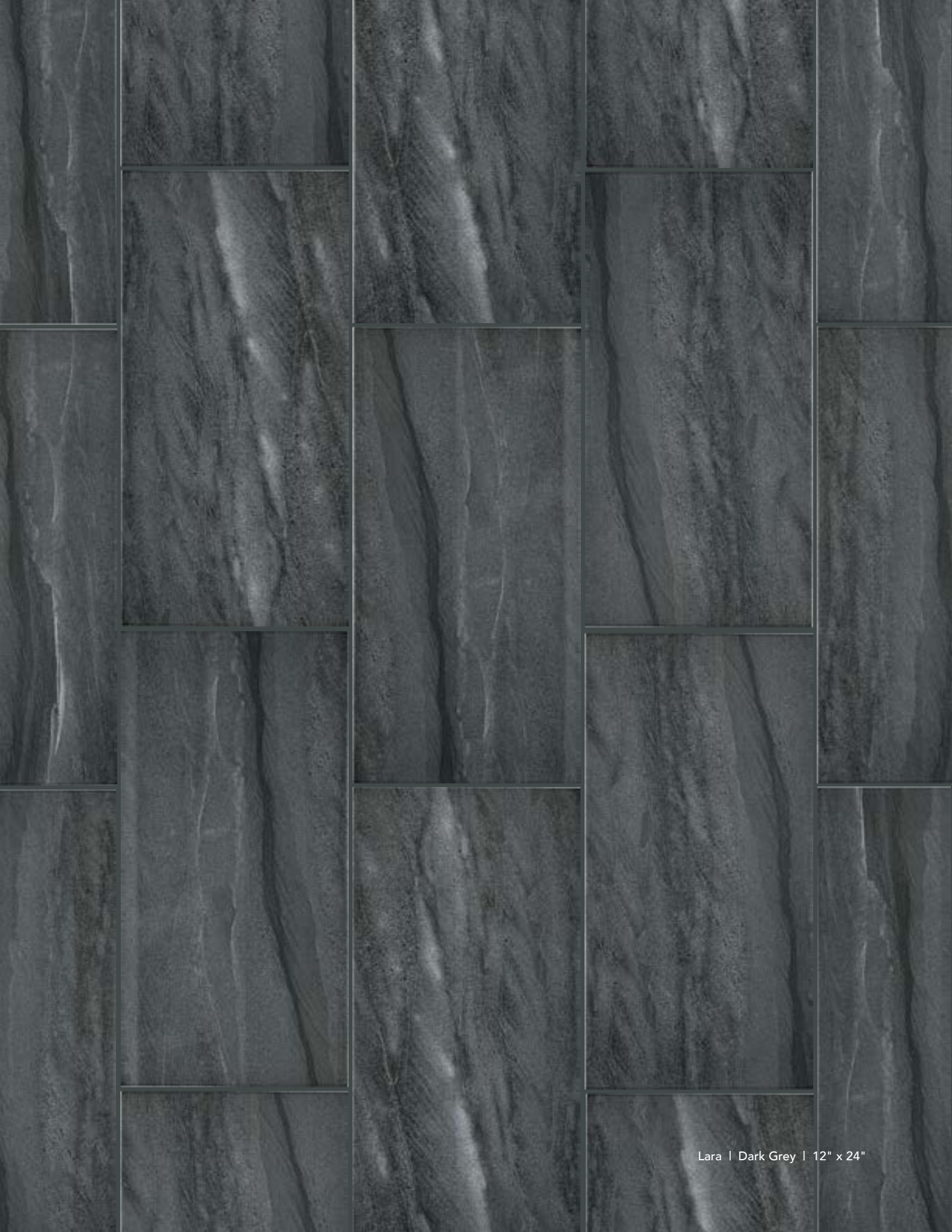
Lara | Dark Grey | 12" x 24"