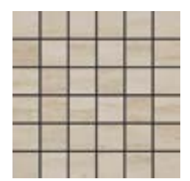
TMHM9194 2" x 2" Malham Beige Mosaic 11.75" x 11.75" Mesh - 0.959 Sqft/Sheet 192