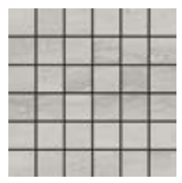
TMHM3569 2" x 2" Malham Grey Mosaic 11.75" x 11.75" Mesh - 0.959 Sqft/Sheet 192