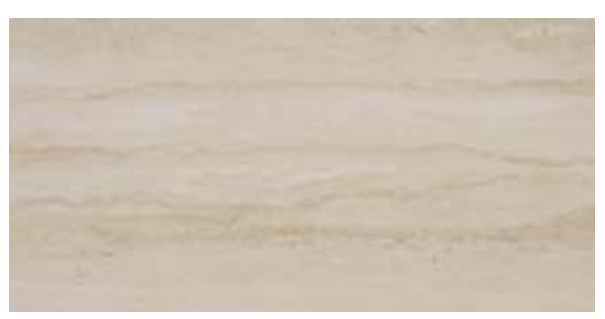
TMHM5302 12" x 24" Malham Beige 25