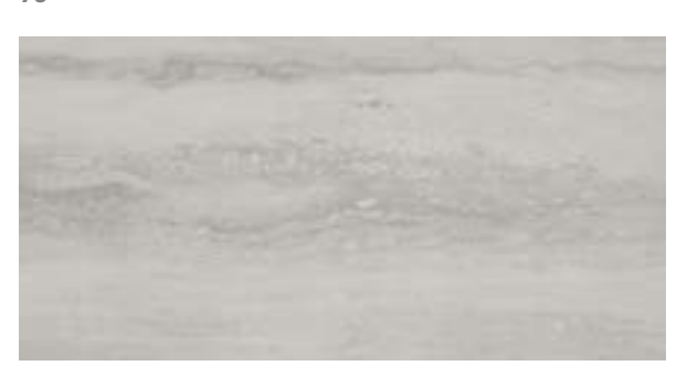
TMHM4404 12" x 24" Malham Grey 25