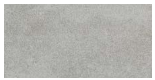
TMAX8905 12" x 24" Matrix Grey Rect 29