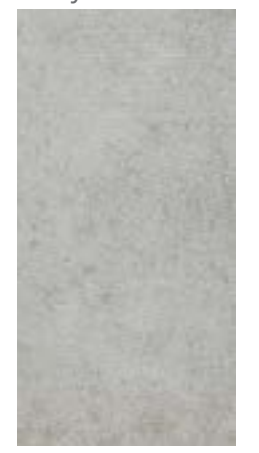
12" x 24" 24" x 24" 2" x 2" Mosaic