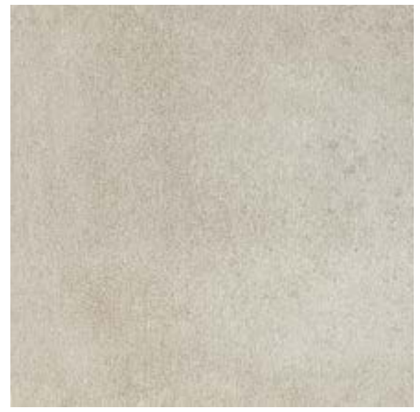
TMAX1988 24" x 24" Matrix Beige Rect 44