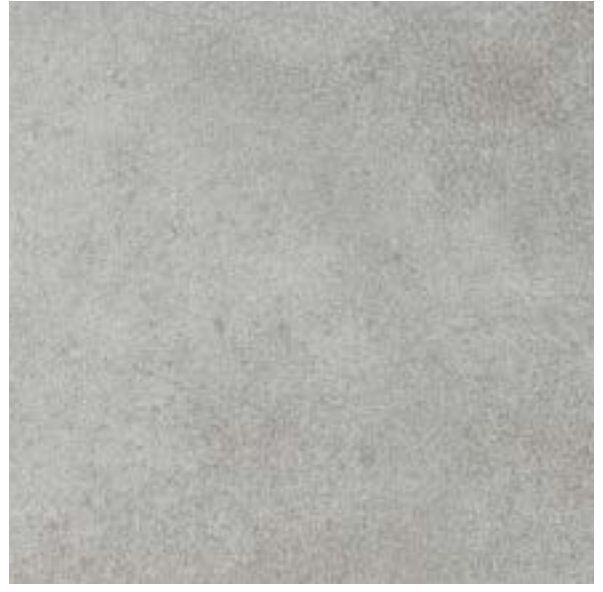
TMAX4850 24" x 24" Matrix Grey Rect 44