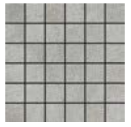
TMAX2750 2" x 2" Matrix Grey Mosaic 11.75" x 11.75" Mesh - 0.959 Sqft/Sheet 187