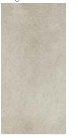
12" x 24" 24" x 24" 2" x 2" Mosaic