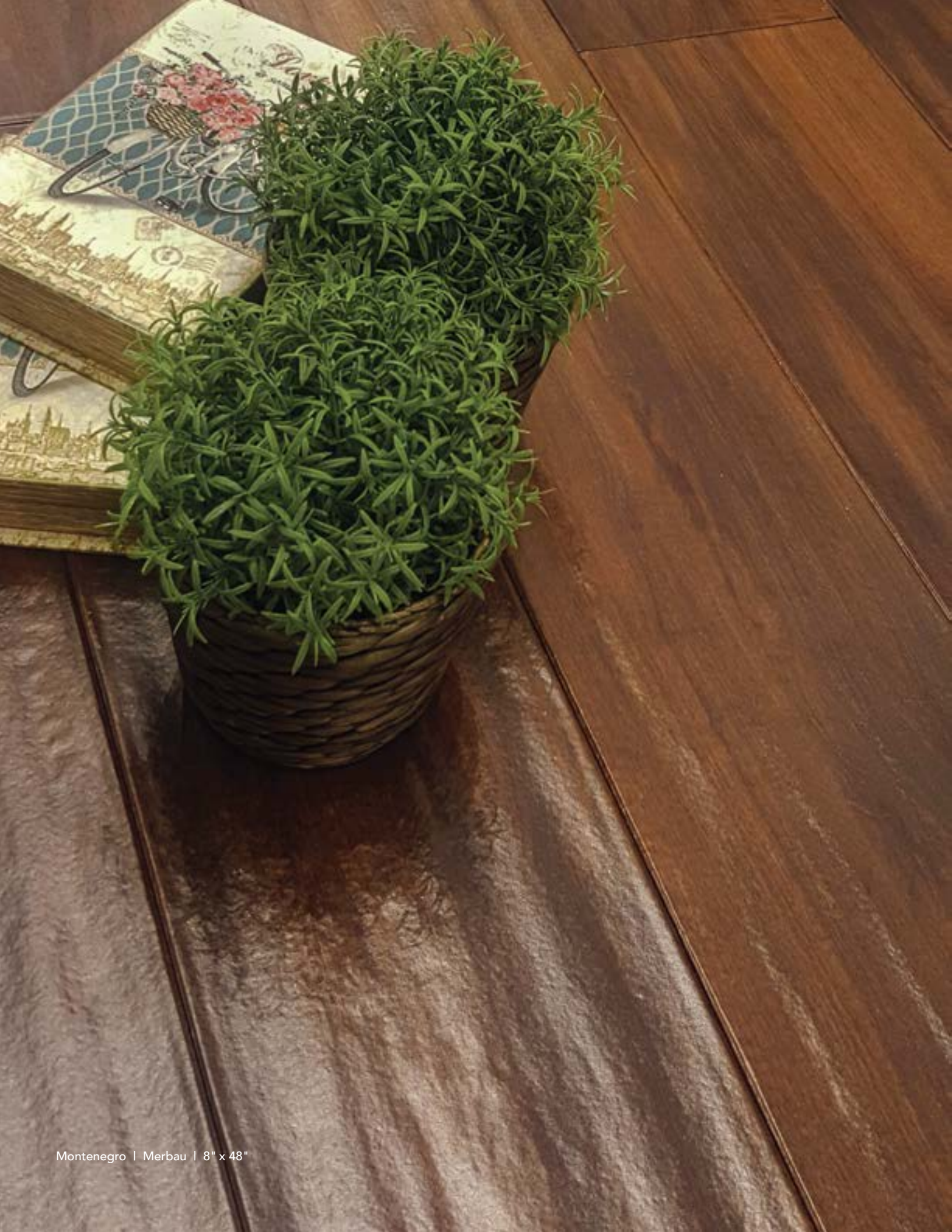
Montenegro | Merbau | 8" x 48"