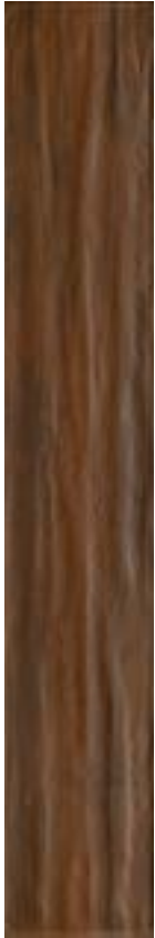
8" x 48"