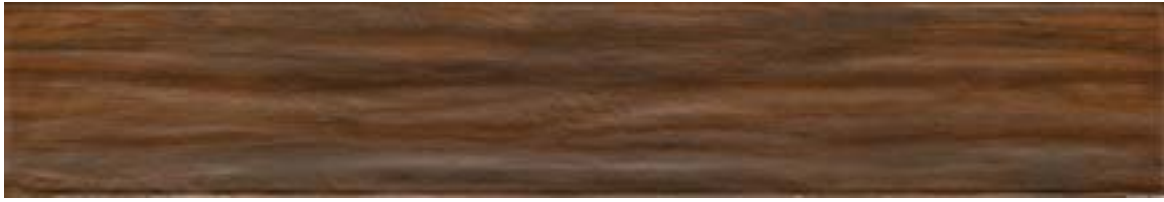
MNT0848 8" x 48" Montenegro Merbau 35