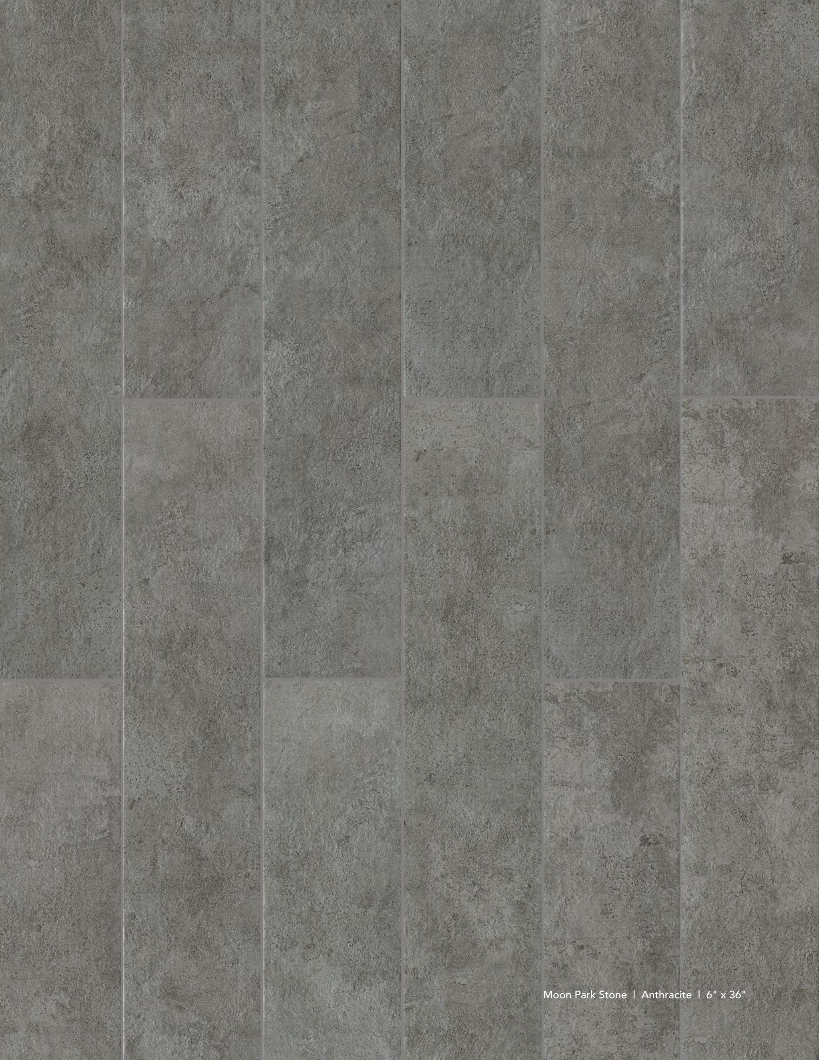
Moon Park Stone | Anthracite | 6" x 36"