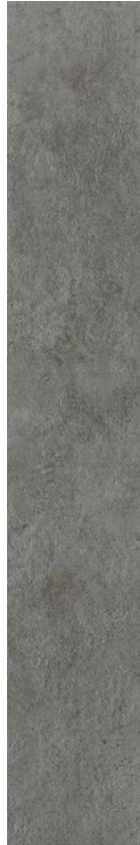
6" x 36"