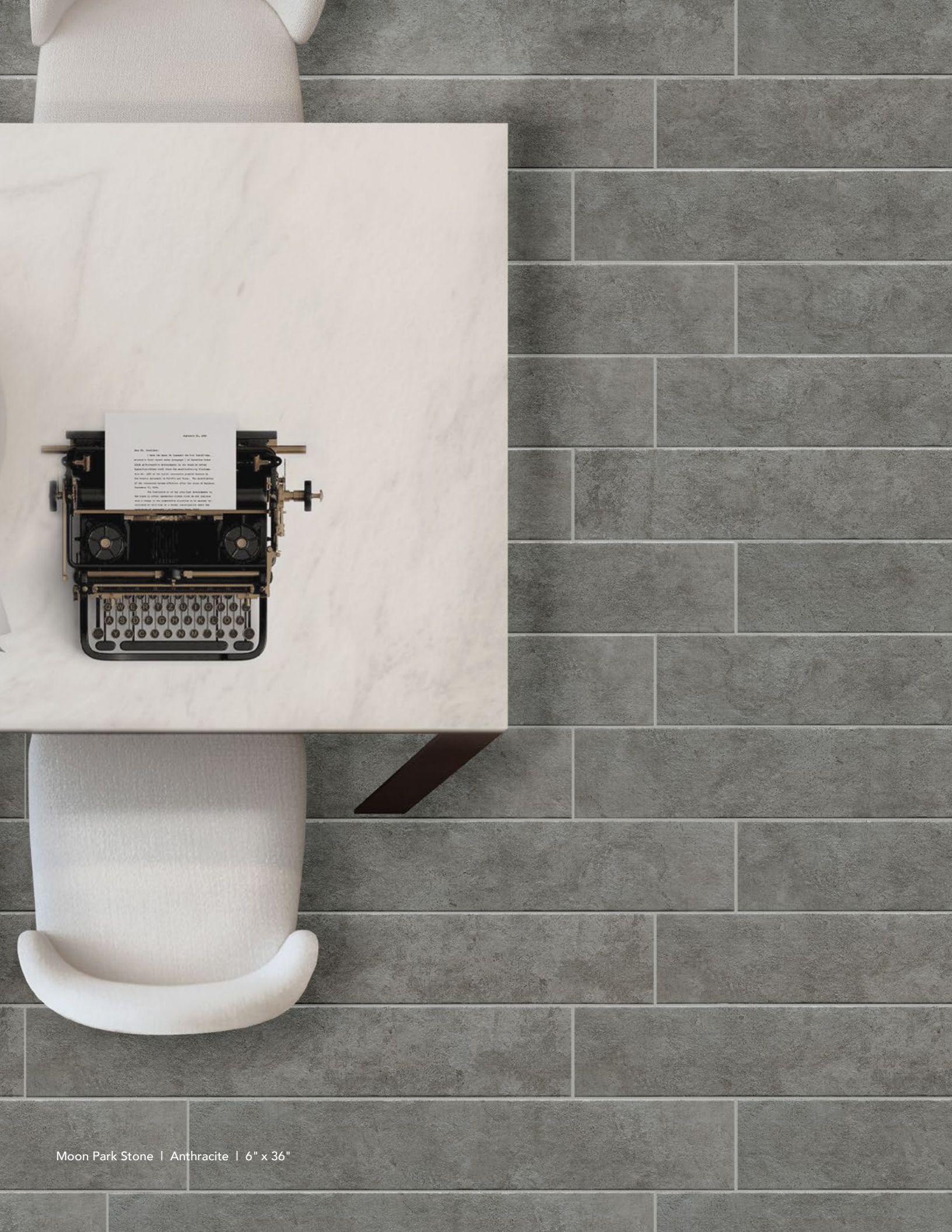
Moon Park Stone | Anthracite | 6" x 36"