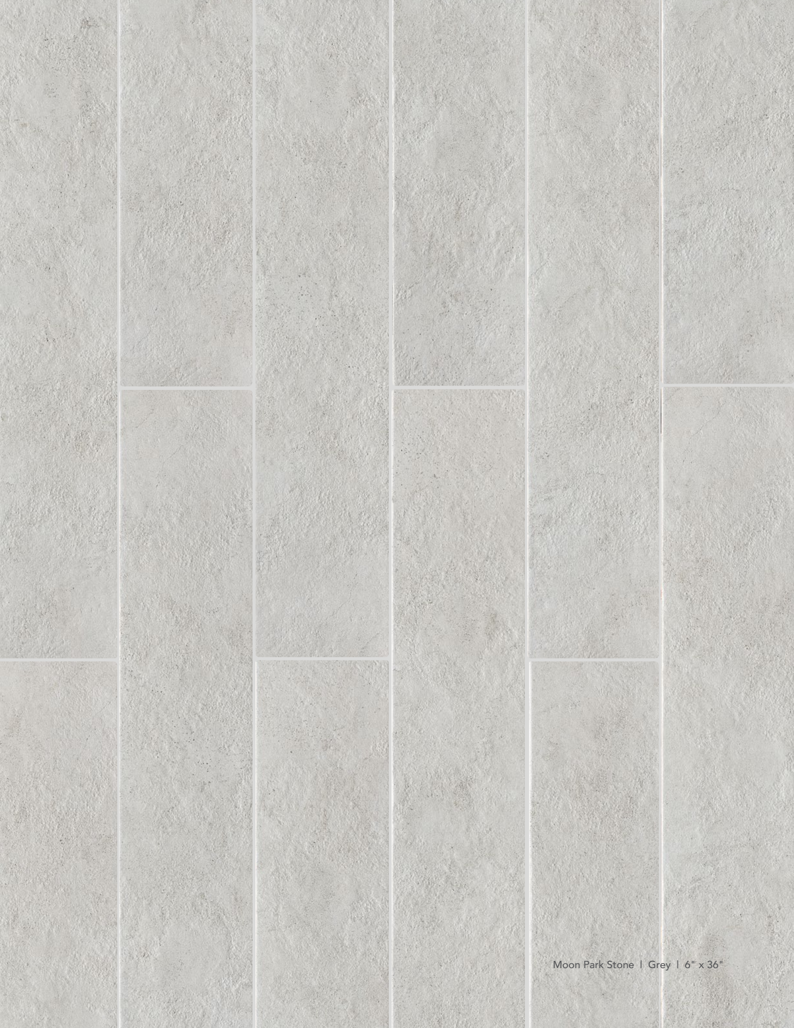
Moon Park Stone | Grey | 6" x 36"