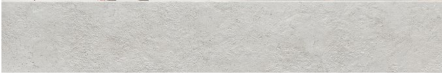
TMPA8302 6" x 36" Moon Park Stone Grey