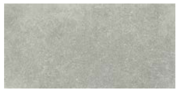
CSTR30 12" x 24" Stride Light Beige 25