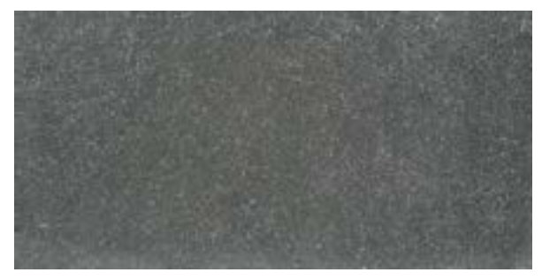
CSTR20 12" x 24" Stride Dark Grey 25