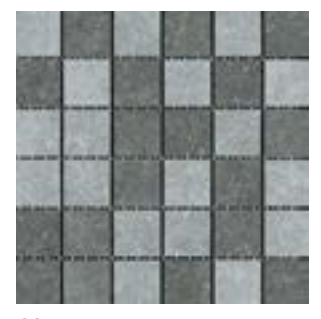
CSTRM1 2" x 2" Stride Mix Grey Mosaic 11.75" x 11.75" Mesh - 0.959 Sqft/Sheet 187