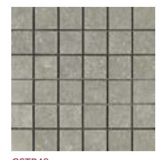
CSTR42 2" x 2" Stride Dark Beige Mosaic 11.75" x 11.75" Mesh - 0.959 Sqft/Sheet 187