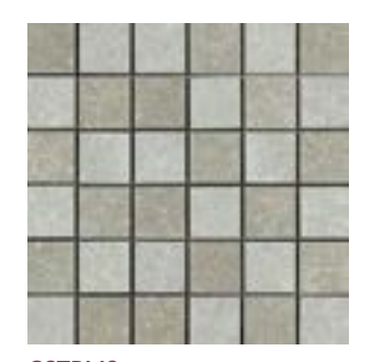
CSTRM2 2" x 2" Stride Mix Beige Mosaic 11.75" x 11.75" Mesh - 0.959 Sqft/Sheet 187