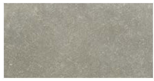
CSTR40 12" x 24" Stride Dark Beige 25