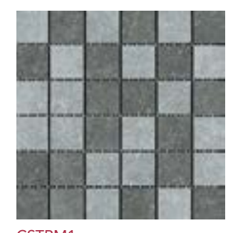
CSTRM1 2" x 2" Stride Mix Grey Mosaic 11.75" x 11.75" Mesh - 0.959 Sqft/Sheet 187