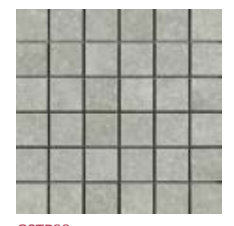
CSTR32 2" x 2" Stride Light Beige Mosaic 11.75" x 11.75" Mesh - 0.959 Sqft/Sheet 187