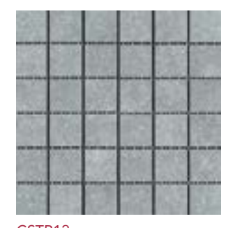
CSTR12 2" x 2" Stride Light Grey Mosaic 11.75" x 11.75" Mesh - 0.959 Sqft/Sheet 187