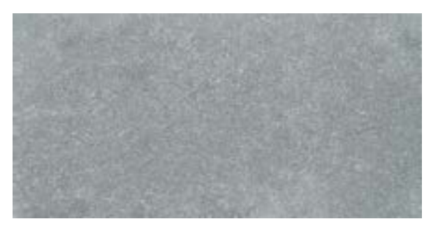
CSTR10 12" x 24" Stride Light Grey 25