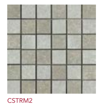
2" x 2" Stride Mix Beige Mosaic 11.75" x 11.75" Mesh - 0.959 Sqft/Sheet 187