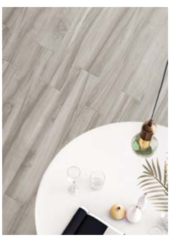
Products Shown 6" x 36" Topwood Ash - TPW03