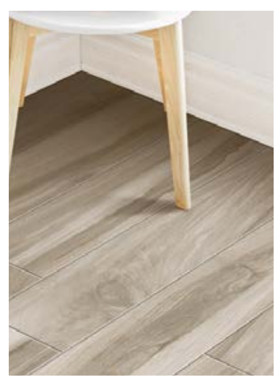
Products Shown 6" x 36" Topwood Latte - TPW16