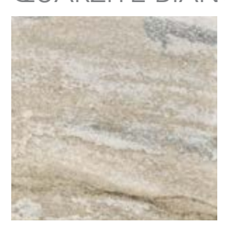
TRBN0808 8" x 8" Trail Quarzite Bianco