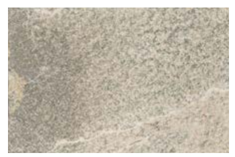
TRBN0812 8" x 12" Trail Quarzite Bianco