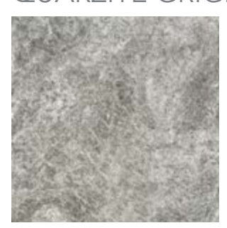
TRGR0808 8" x 8" Trail Quarzite Grigio