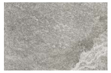
TRGR0812 8" x 12" Trail Quarzite Grigio