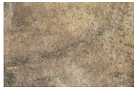
TRMX0812 8" x 12" Trail Porfido Mix