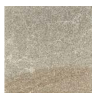
TRPG0808 8" x 8" Trail Piasentina Greige