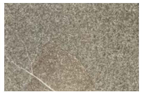
TRPG0812 8" x 12" Trail Piasentina Greige