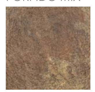
TRMX0808 8" x 8" Trail Porfido Mix