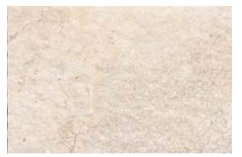
TMBTRAV 8" x 8" + 8" x 12" Tumbled Travertine