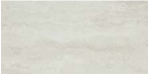
TWMT2605 12" x 24" Walmont Bone 25