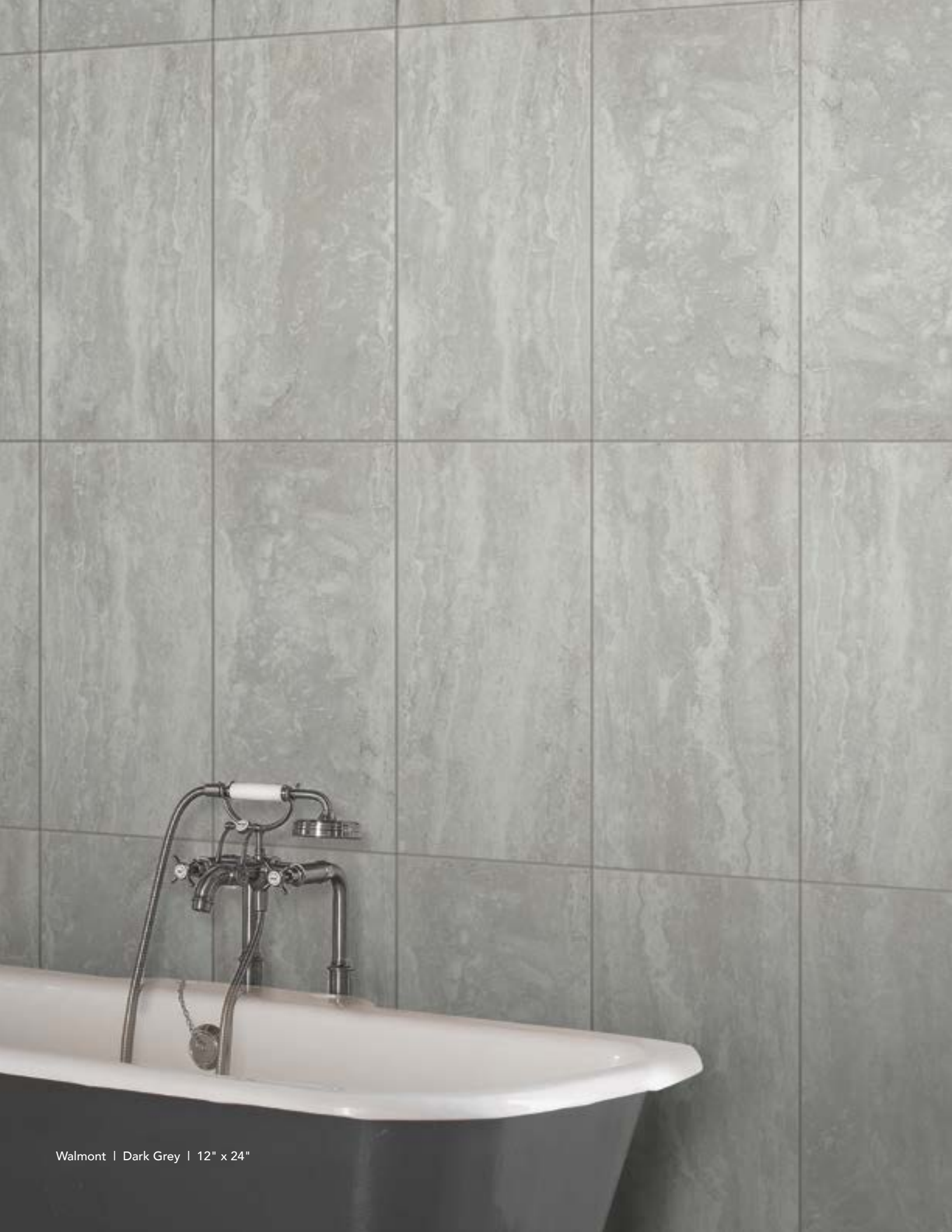
Walmart | Dark Grey | 12" x 24"