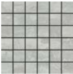
TWMT8656 2" x 2" Walmont Dark Grey Mosaic 11.75" x 11.75" Mesh - 0.959 Sqft/Sheet 192