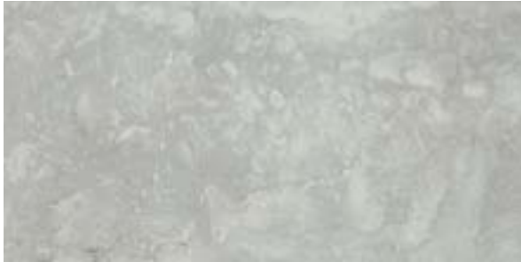
TWMT9589 12" x 24" Walmont Dark Grey 25