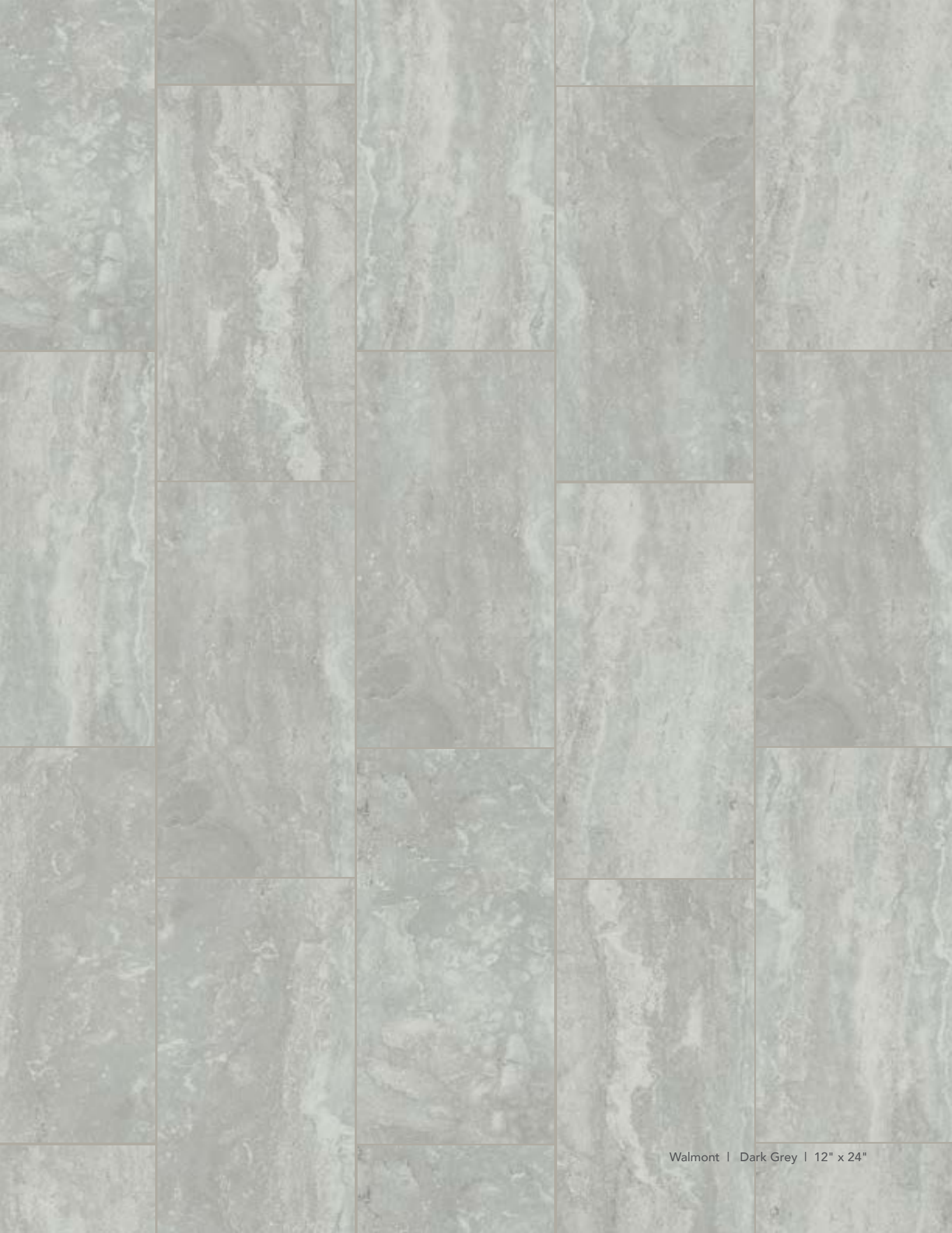
Walmart | Dark Grey | 12" x 24"