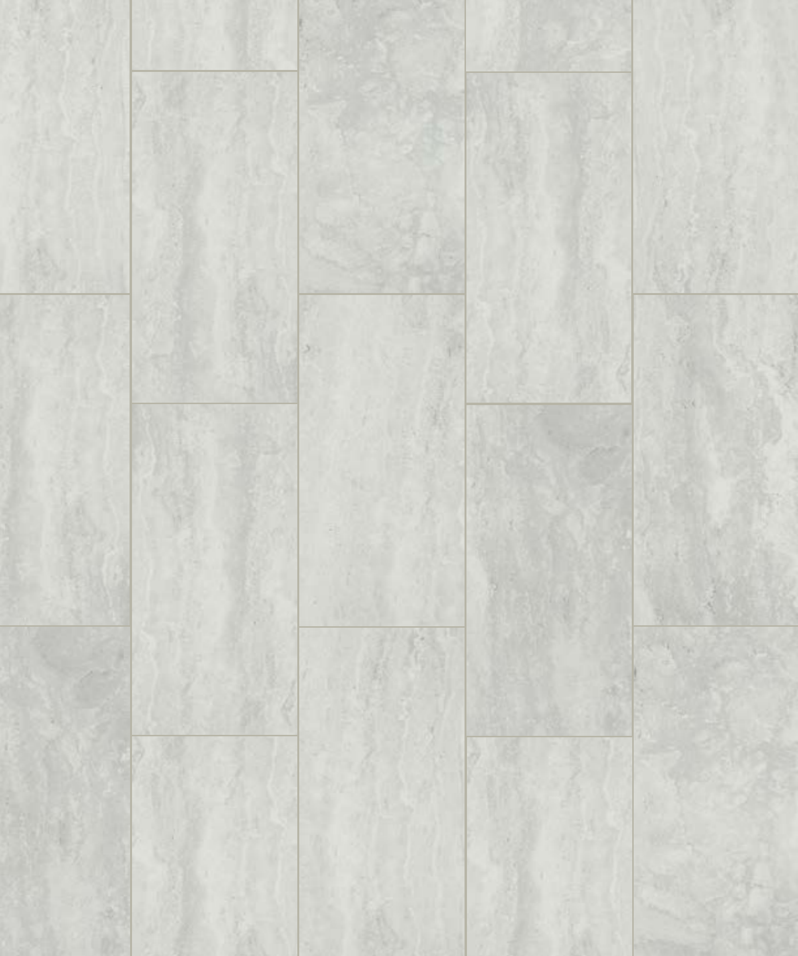
Walmart | Light Grey | 12" x 24"