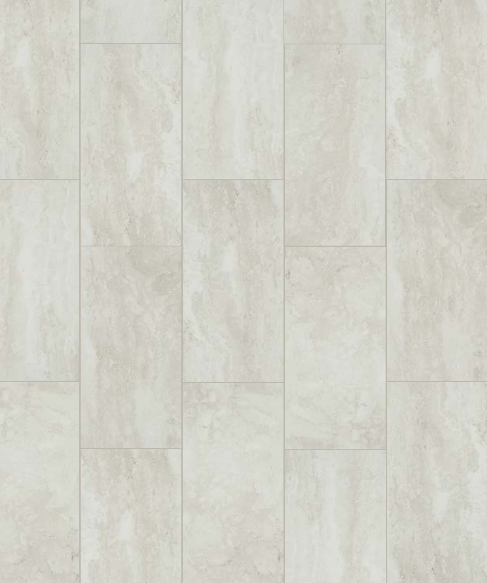
Walmart | Bone | 12" x 24"