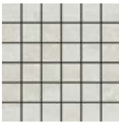
TWMT5962 2" x 2" Walmont Bone Mosaic 11.75" x 11.75" Mesh - 0.959 Sqft/Sheet 192